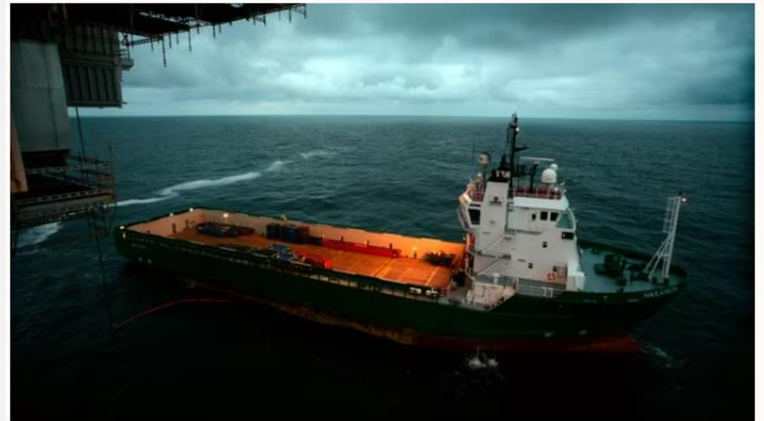
I KRISE: Havila Shipping mener at det er «strengt nødvendig og påkrevd» å forskjellsbehandle.

Ikke bare står aksjonærene sist i køen – av og til står noen aksjonærer lengre bak enn andre. – Selskapene må være oppmerksomme, sier Oslo Børs etter forrige ukes børshot.