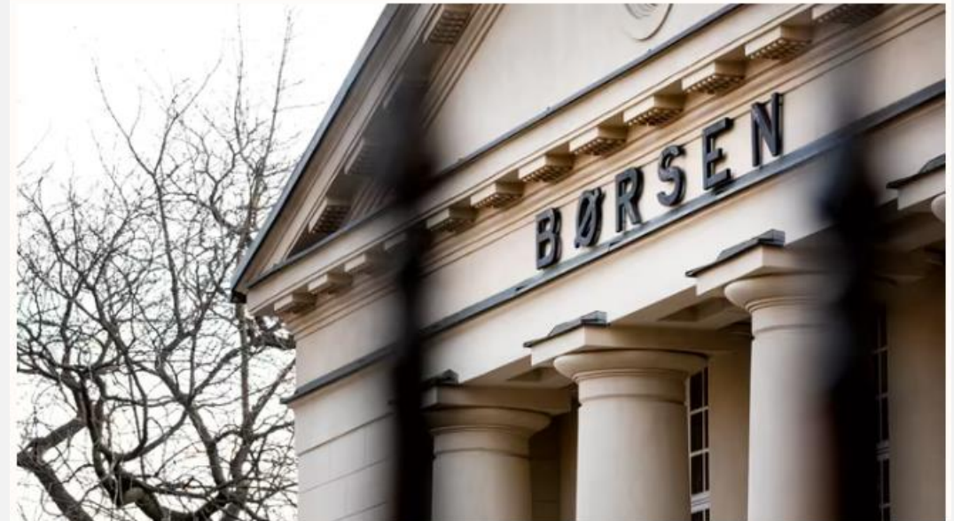
REKORDÅR: Stadig mer penger kanaliseres til næringslivet gjennom Oslo Børs.

Over syv av ti kroner som hentes gjennom nyutstedelser i det norske aksjemarkedet, hentes fortsatt gjennom rettede emisjoner. Nykommerne trekker opp totalen.