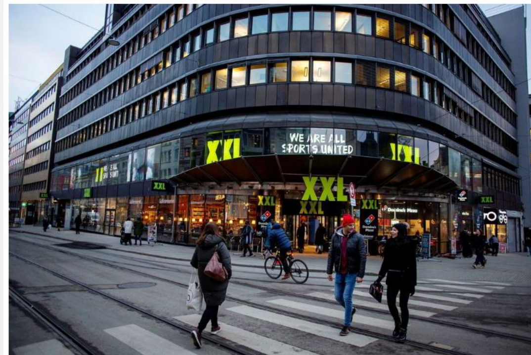
Folketrygdfondet stemte mot XXLs forslag til incentivprogram for ledelsen. På bildet er XXLs butikk i Oslo sentrum.

1 MIN | PUBLISERT: 03.02.20 — 09.51 | OPPDATERT: 3 ÅR SIDEN